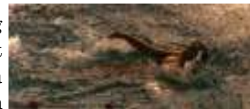
Water for fun...

The Footprint Trust has produced an easy to understand ‘tips leaflet’ aimed at householders and gardeners. This is available from Ventnor Botanic Garden, libraries and the Riverside Centre.