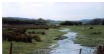
Water for life...