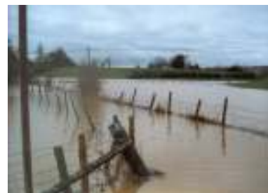
Water and Climate Change...

The Footprint Trust believes that the biggest threat to the landscape, people and wildlife of the Isle of Wight is climate change. Thus dependency on fossil fuels must be reduced.